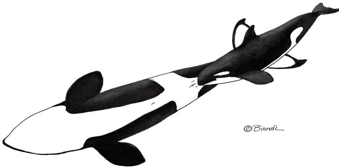
Figure 4. Two positions of a presumed mother killer whale nursing her yearling calf. A) Ventral-swimming calf nursing from ventral-swimming mother. B) Dorsal-swimming calf nursing from ventral swimming mother. Drawn from photographs taken off Southern California on 27 November 2009.