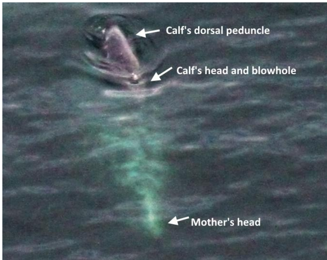
Figure 1. Gray whale calf at the water surface back-riding the rear left peduncle area of its mother as she swims below the water surface (mother has lighter body color) on 15 February 2011. Apparent nursing also was observed as the mother rested at the surface.