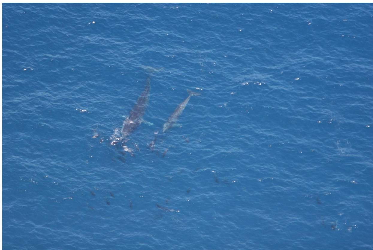
Figure 3. Same fin whale mother-calf pair as depicted in Figure 2, following and interacting with northern right whale dolphins on 6 June 2009. Photograph by Lori Mazucca, NMFS permit 14451.