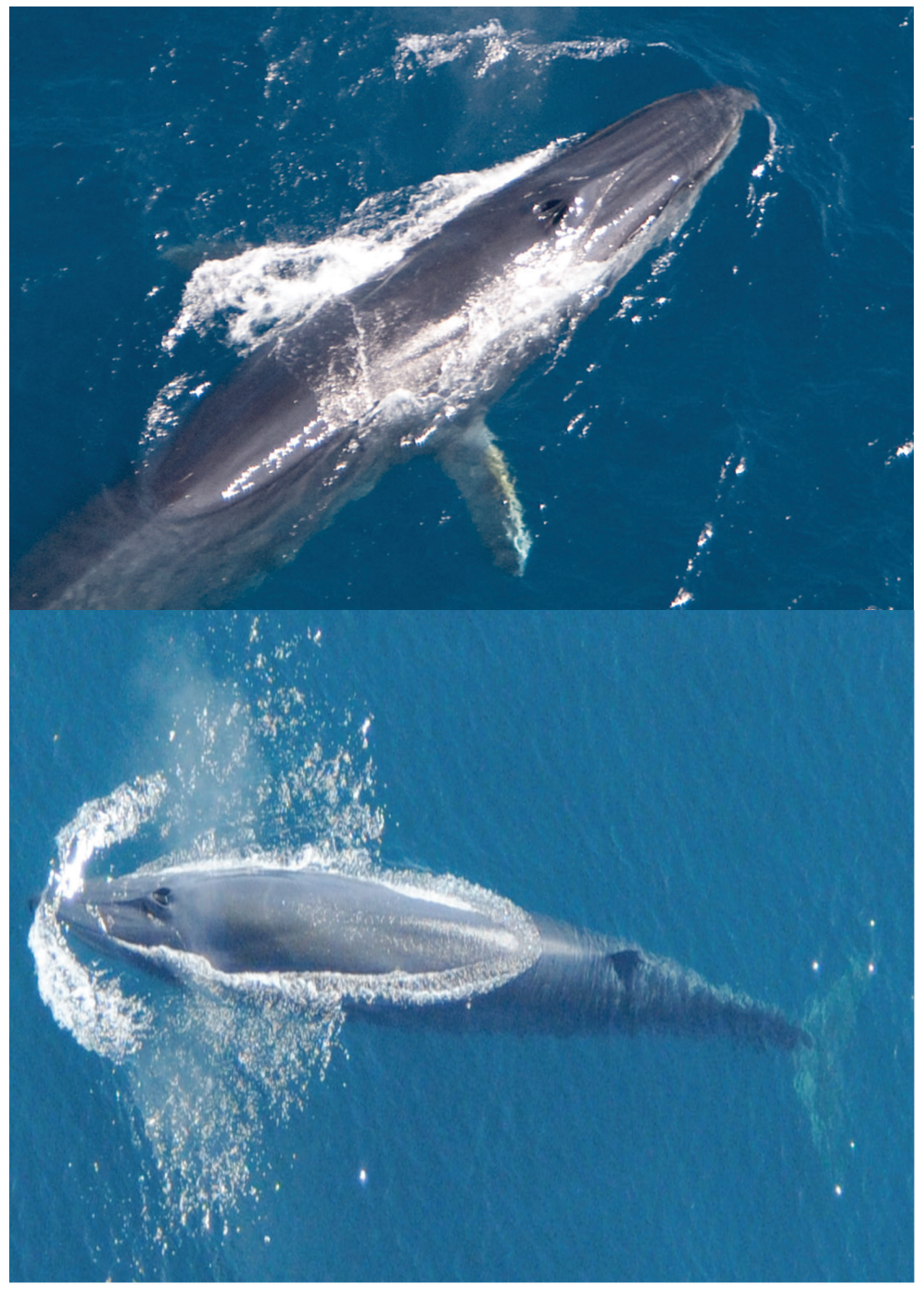
Figure 2. (Top) Bryde's whale seen on 19 October 2008, showing head in right dorso-lateral view with central longitudinal ridge on the rostrum and the well-marked, smaller lateral ridges on each side (diagnostic character of species); the darker longitudinal stripes represent the shallow grooves on either side of the ridges. (Bottom) Bryde's whale seen on 24 September 2010; dorsal view of full body, showing prominent dorsal fin and the well-defined central longitudinal ridge on rostrum flanked by an auxiliary ridge on each side.